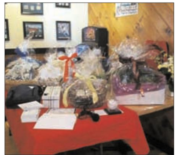
More than 25 baskets were raffled off, many of them full of donations from local businesses.

New members interested in community service and professional networking are encouraged to join. For more information, visit www.facebook.com/putnamrotaract-club .